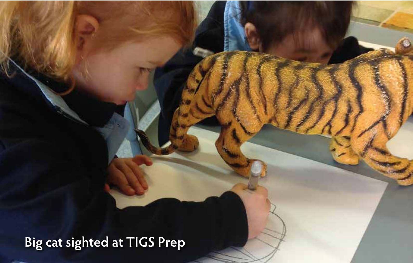
Big cat sighted at TIGS Prep